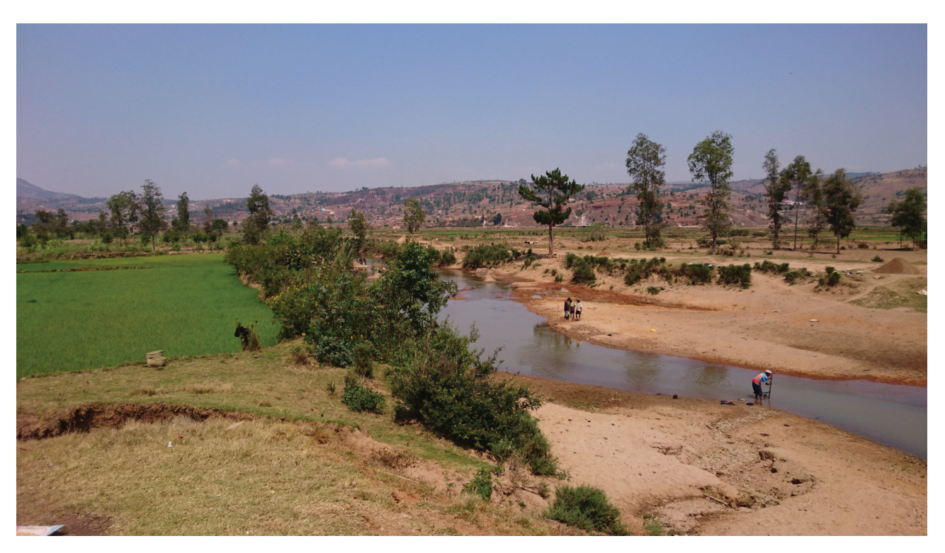
Fig. 4.2 for Question 4