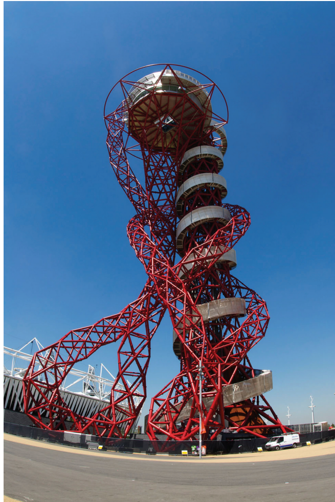
Olympic Orbit sculpture in Olympic Park, Stratford

21 Choose one of the following options based on Image A: