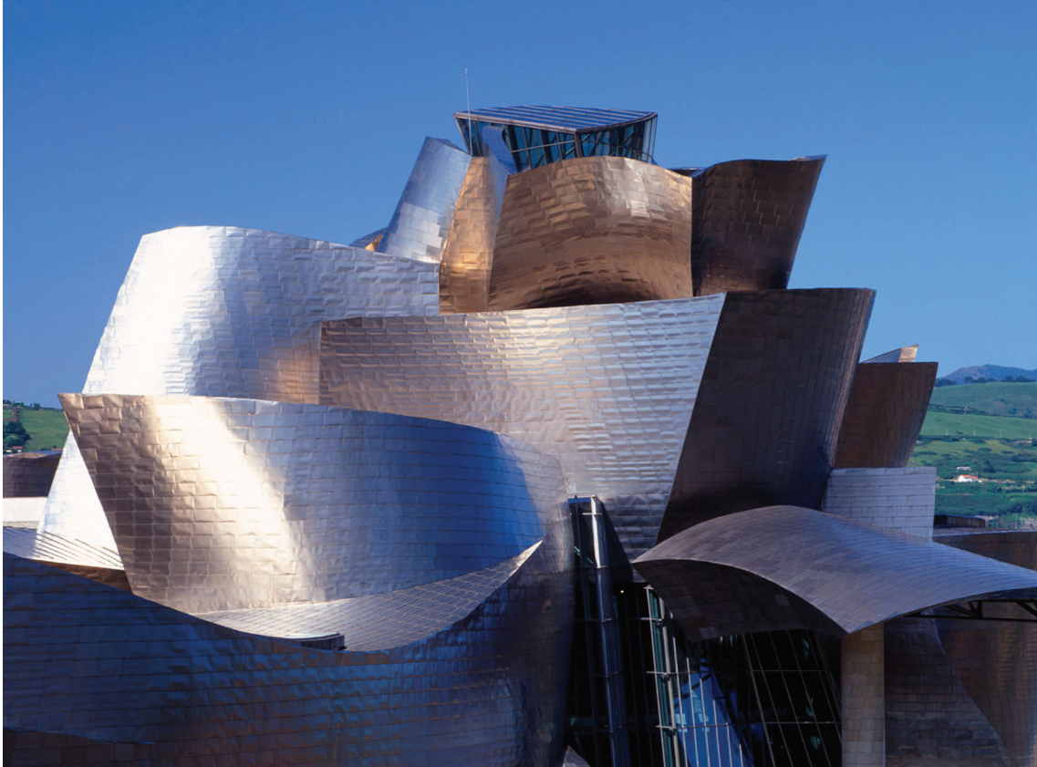
Guggenheim Museum, Bilbao, Spain

23 Choose one of the following options based on Image C: