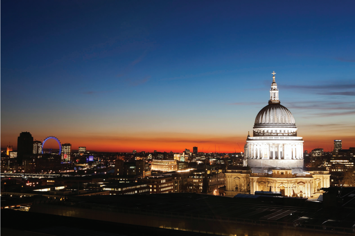
St Paul's Cathedral and London City at dusk London, England

23 Using Image C as a starting point, produce one of the following: