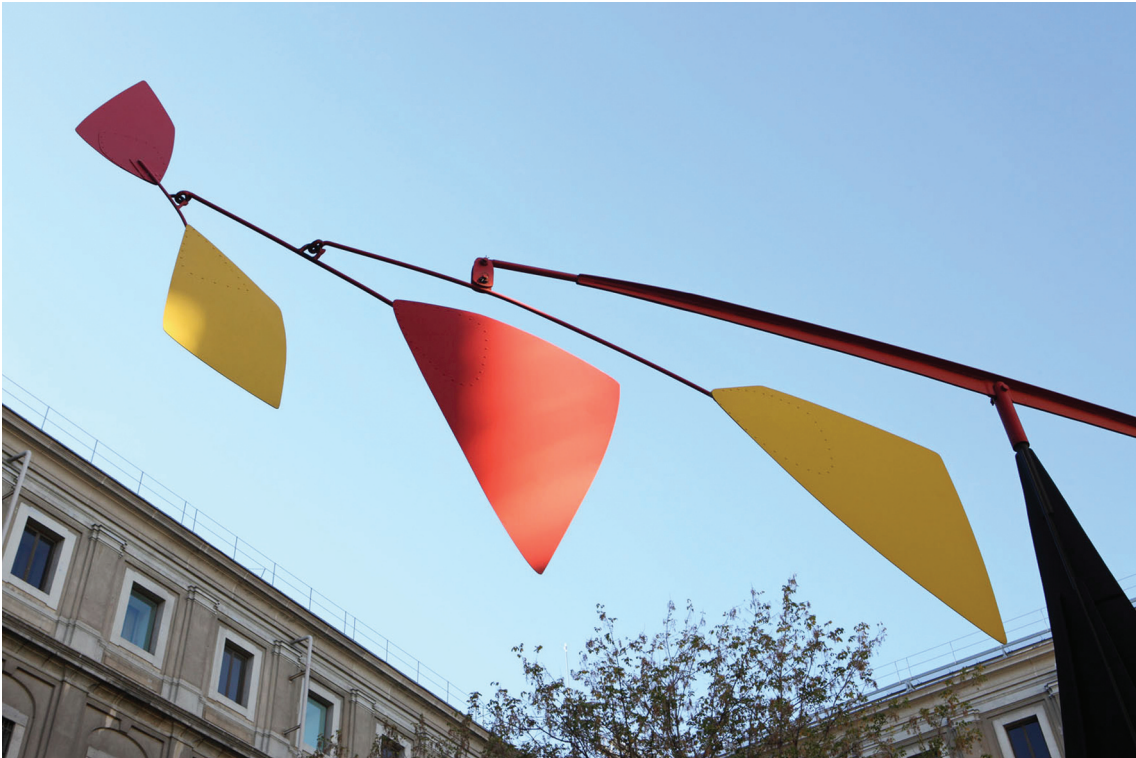
Large metal standing mobile sculpture by Alexander Calder Courtyard of Reina Sofia Modern Art Museum, Madrid, Spain

21 Using Image A as a starting point, produce one of the following: