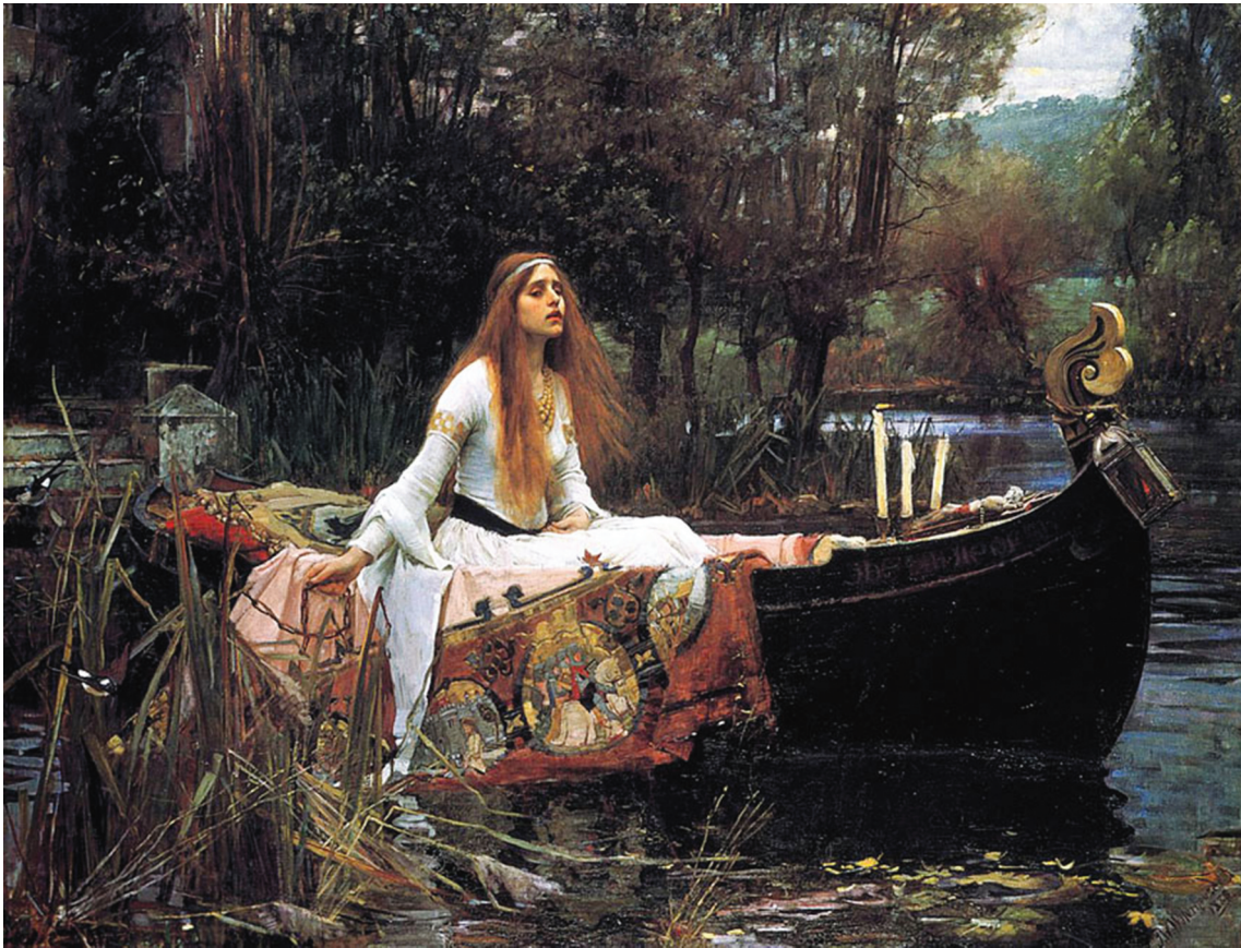
The Lady of Shalott by John William Waterhouse 1888 oil on canvas 153 × 200 cm Tate Gallery, London

22 Using Image B as a starting point produce one of the following: