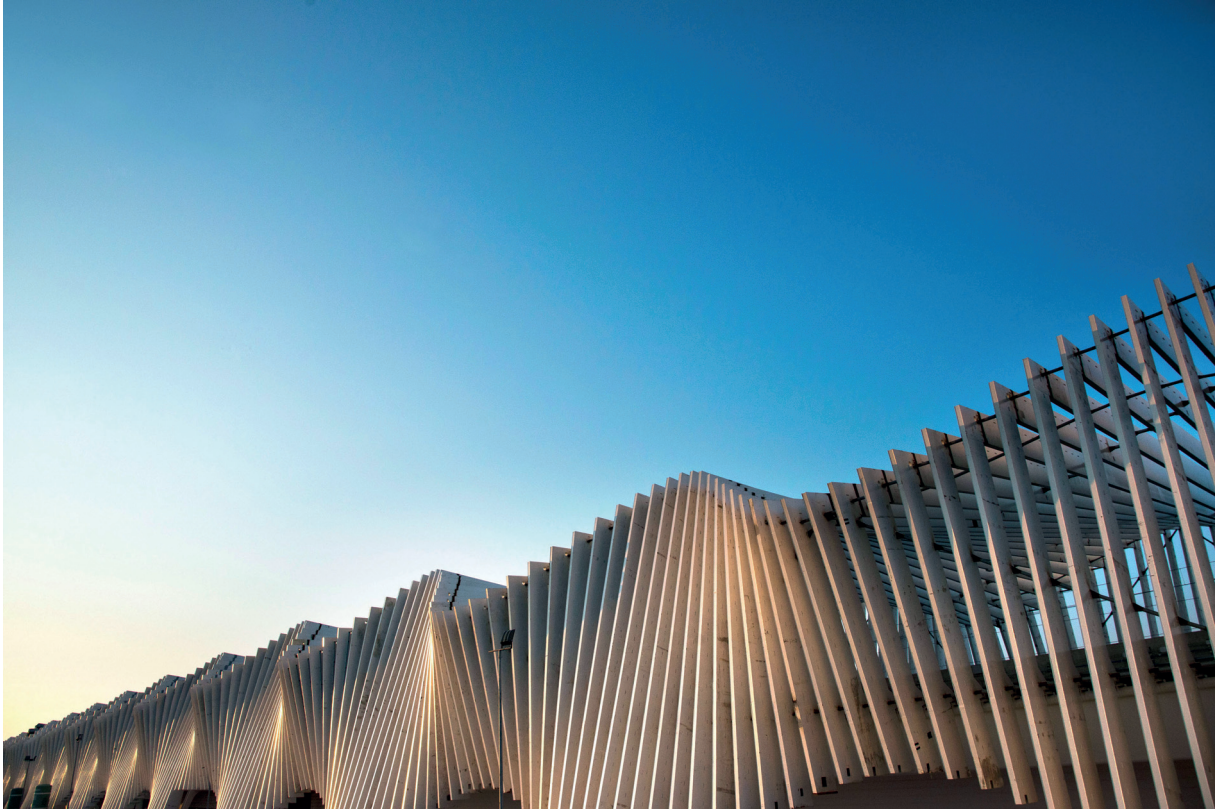
'Mediopadana Station' Reggio Emilia, Italy 2013

23 Using Image C as a starting point, produce one of the following: