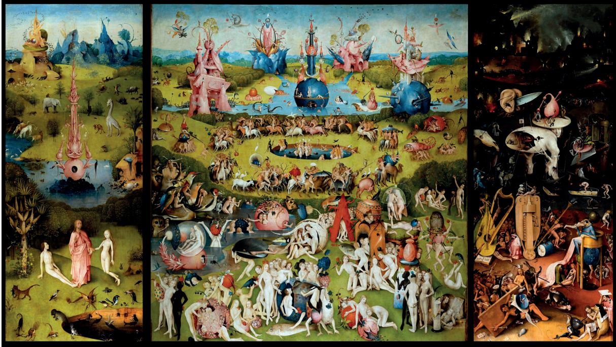
'Garden of Earthly Delights' by Hieronymus Bosch, 1503–1504

22 Using Image B as a starting point produce one of the following: