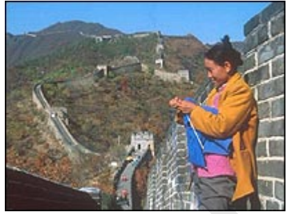
Knitting is not just a hobby, for some it is an economic lifeline

There used to be factory work for hundreds here. But, like so many other communities, far away from the spotlight of the big