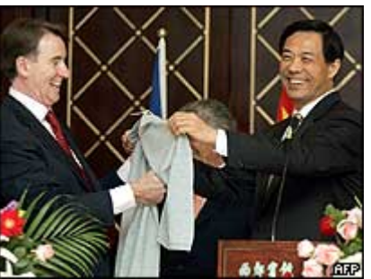
The talks centred on avoiding a trade war over T-shirts and flax yarn

The explosion in China's textile trade has followed the scrapping of the global Multi Fibre Agreement on 31 December 2004. Since then, both the EU and US say that textile exports have soared. As he arrived in Shanghai, Mr Mandelson told reporters that he looked forward to reaching a last-minute deal – but would not shrink from taking action. "If we don't make an agreement, we will have to take other measures. This question has been dragged on over many days. We have a limited opportunity."