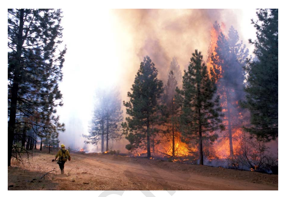
A photo from the California Department of Forestry taken in 1999.