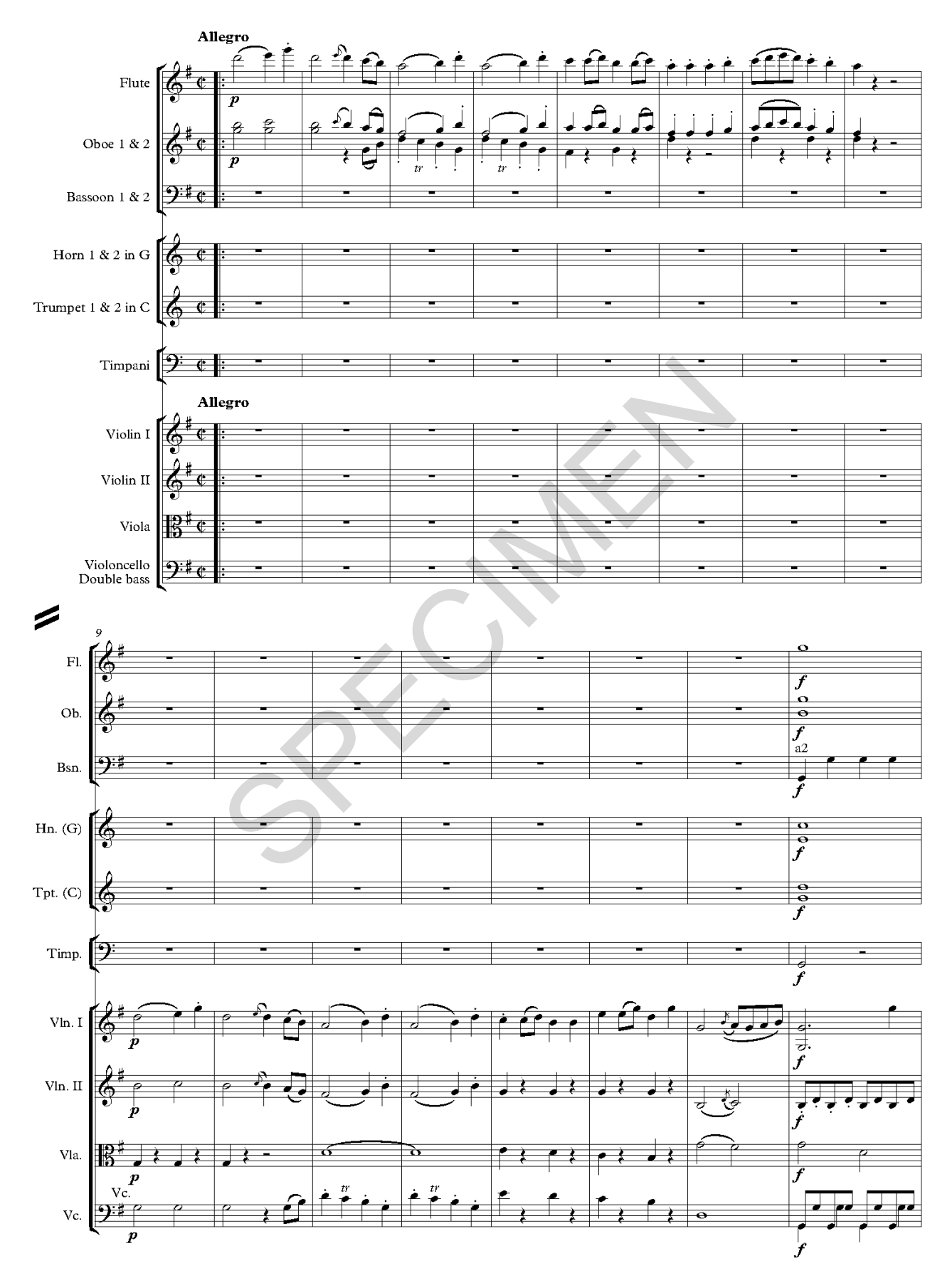
Extract 3 - from Haydn's Symphony No. 100 in G major, 'Military' 1<sup>st</sup> movement. [⊙ track 4 and track 5]