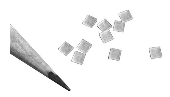
Fig. 2: some LiF chips as used in TLD, with a pencil tip for scale.

Crystals of LiF are very transparent and only slightly soluble in water. They are used in a number of physical forms but most often cleaved as individual 'chips' measuring about 3.0\,\mathrm{mm} \times 2.0\,\mathrm{mm} \times 1.5\,\mathrm{mm} , a form that suits most of the purposes for which they are used. Although at 2600\,\mathrm{kg}\,\mathrm{m}^{-3} , the density of these LiF crystals is more than twice that of human soft tissue, the absorption of the ionising radiations (alpha, beta and gamma) is very similar. As the absorbed dose would be almost identical to the absorbed dose in the tissue of a radiation worker, this makes them very useful for dosimetry. They also cover a wide range of doses. The type shown in Fig. 2, for instance, has a specified useful range of 20\,\mathrm{mGy} to 500\,\mathrm{Gy} .