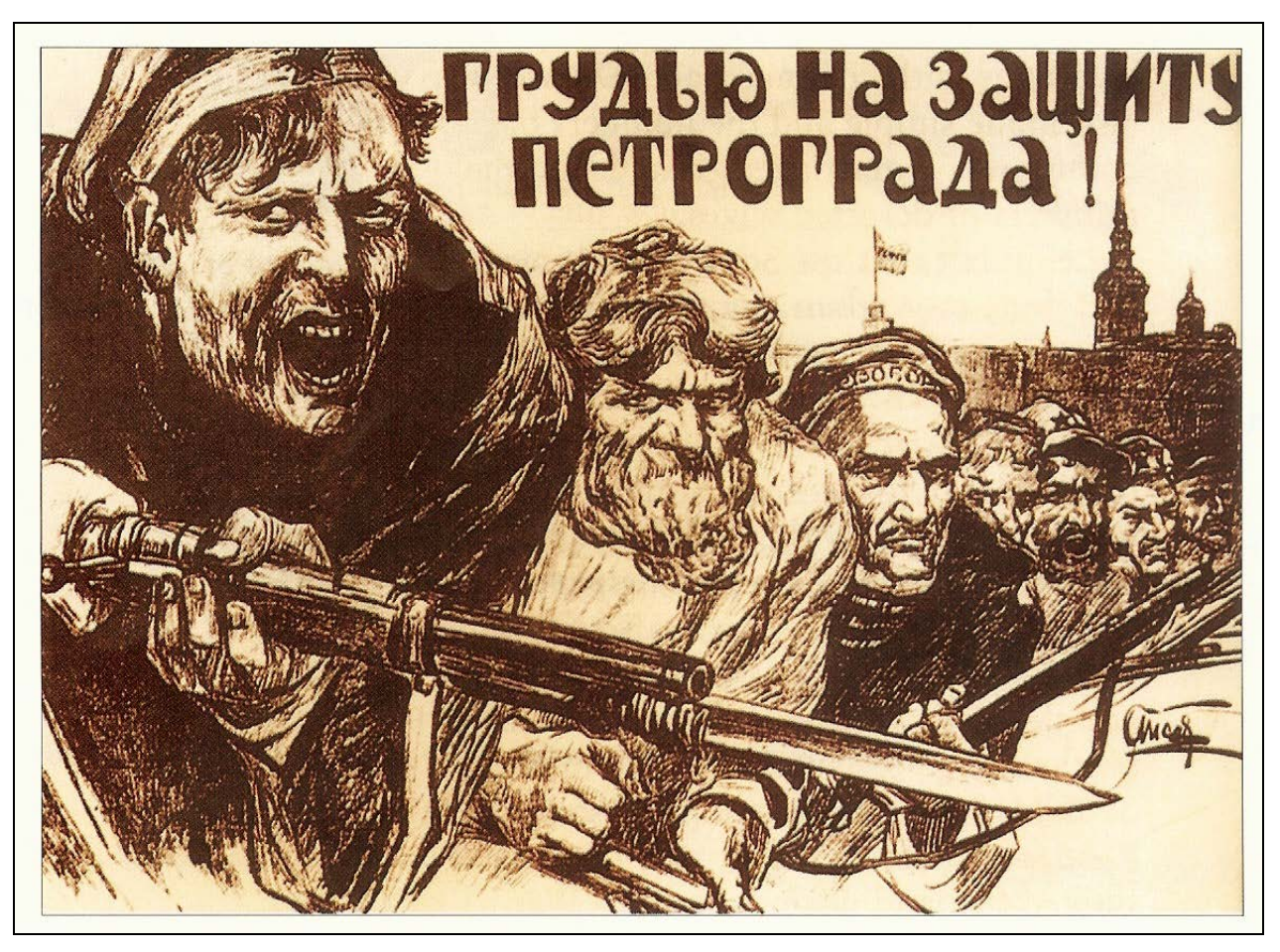
A Bolshevik poster published in 1919. The slogan says 'Shoulder to shoulder in defence of Petrograd'.